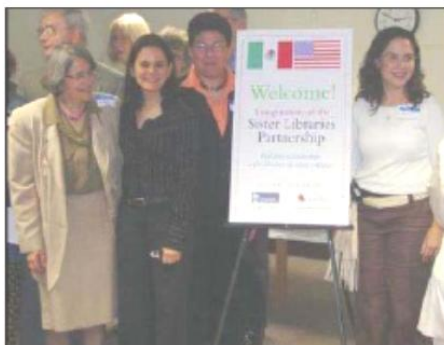
Librarians from both the University of Maryland and the Tecnológico de Monterrey introduce their partnership at Maryland's McKeldin Library in April 2006.

Librarians at the University of Maryland have embraced the opportunity to collaborate with their colleagues in Mexico, thus taking advantage of the ACRL seed grant